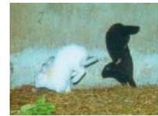
Rabbit “Sauteurs d’Alfort” (type II). They move on forelegs when they are stressed