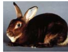
Rabbit « Orylag® castor (type III) bred for its “Rex” fur