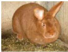
Rabbit « Fauve de Bourgogne » (type I) adapted to a traditional breeding system

Other populations are still selected and the frozen biologic material represents a selection control to measure genetic progress precisely. Moreover, for security, several populations commercially spread are subject to regular cryoconservation in order to save the selection core from a sanitary risk (Inra 2066, commercial lines of Hypharm and Hycole societies...)