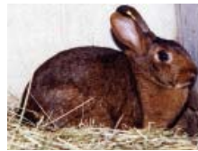
Rabbit « Brun Marron de Lorraine » (type I), endangered breed